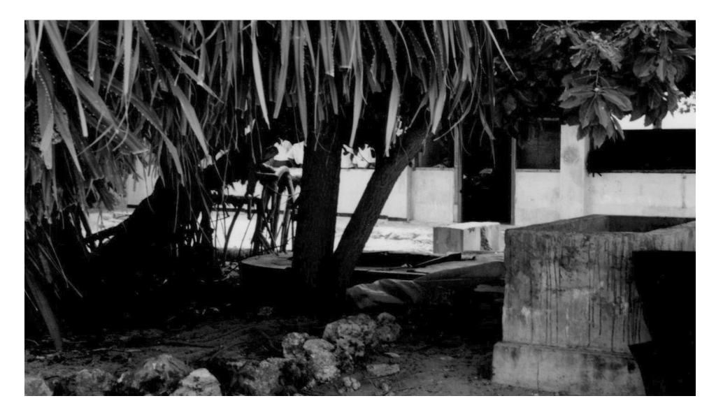
Our Fairies' Bath Well