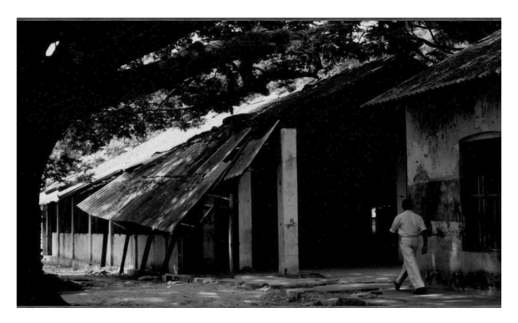
The Old Junior Hall and the Staff Room

Do you recognise these buildings? Could you believe that these are parts of 21<sup>st</sup> century Hartley College? They are: