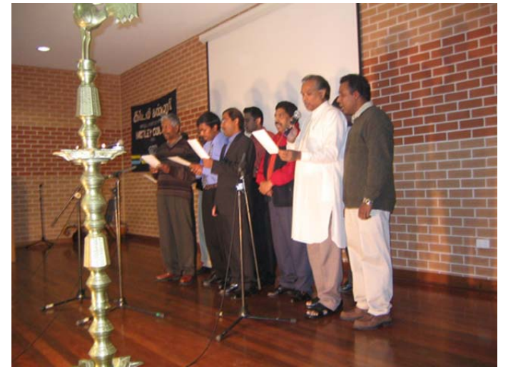
College Song by Hartleyites