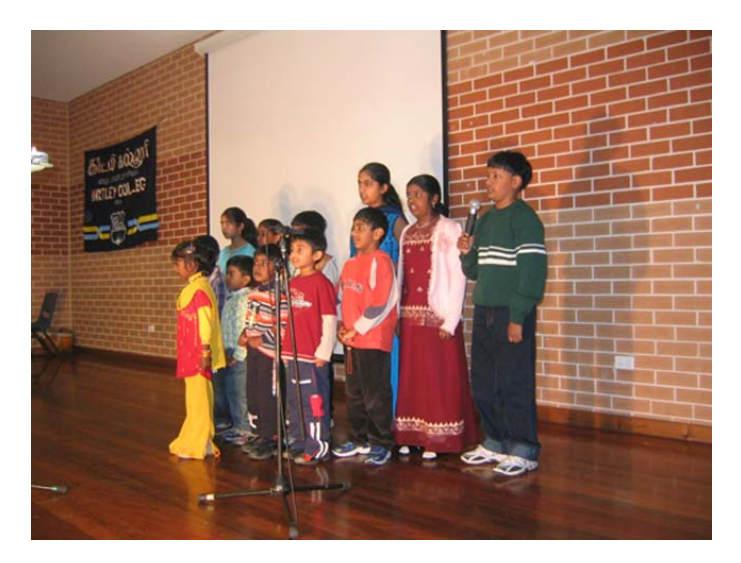
Tamil Valthu by Offspring of Hartleyites

Flashback of AGM/Dinner of HCPPA-NSW Branch: 2005