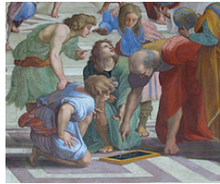
Euclid Greek mathematician

Zonal Level Mathematics Quiz Competition