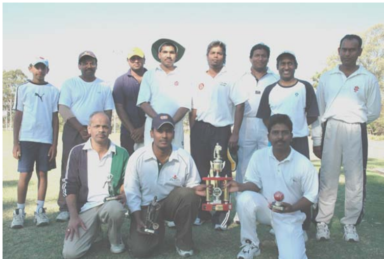
Winning Team with the Trophy

However, Ashok & Suba had different plan and assaulted the bowlers with 38 runs in 25 balls, an impressive run rate of 9.12 per over and reached 4/134. At this stage, Hindu College required 40 runs in 37 balls to win and they were looked like getting the required runs comfortably.