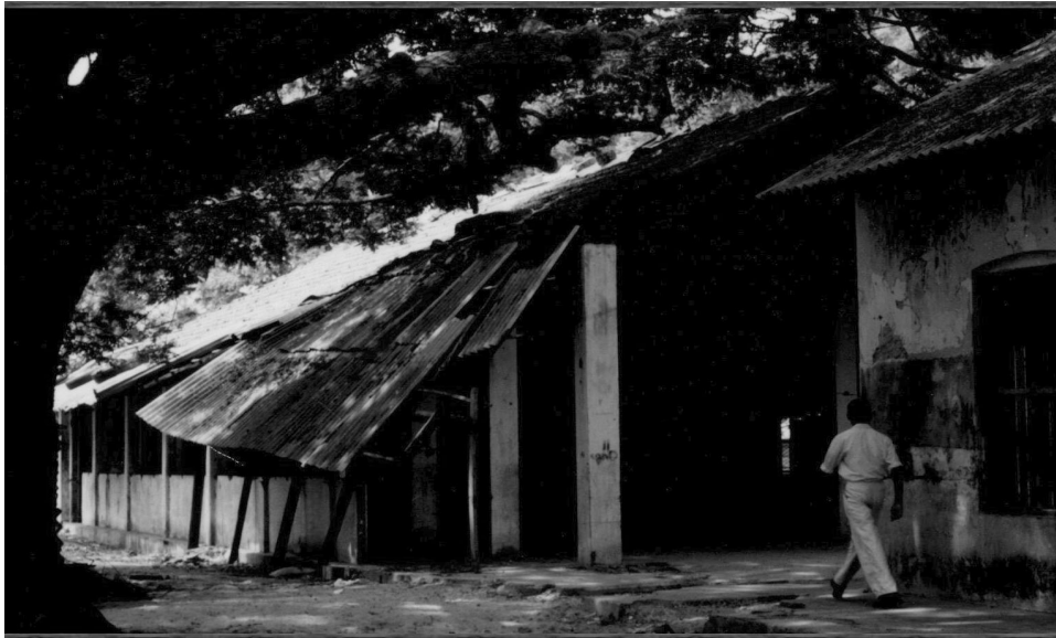
The Old Junior Hall and the Staff Room

Do you recognise these buildings? Could you believe that these are parts of 21 st century Hartley College? They are: