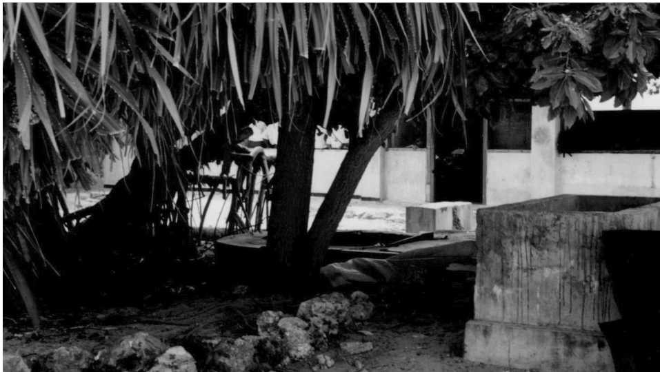
Our Fairies' Bath Well